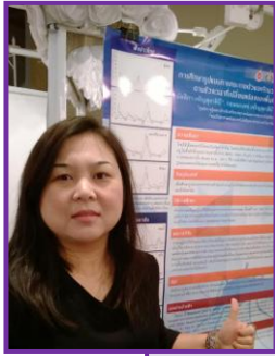
School of Science