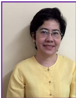
School of Informatics