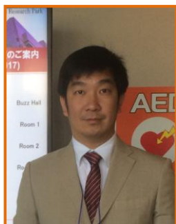
School of Pharmacy