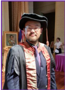
School of Science