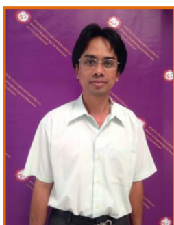
School of Engineering and Resources