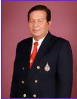
School of Informatics