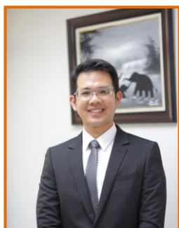
School of Pharmacy