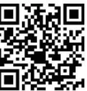
ZJU Degree Programs

Join Us, Solve the Greatest Challenges Together.