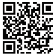
Dual Degree Programs

ZJU-UIUC Institute Facebook @ZjuuiucInstitute